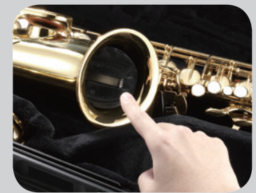
Smoothly slip into bell. A velvet bag is included for better protection and easier access inside the bell.